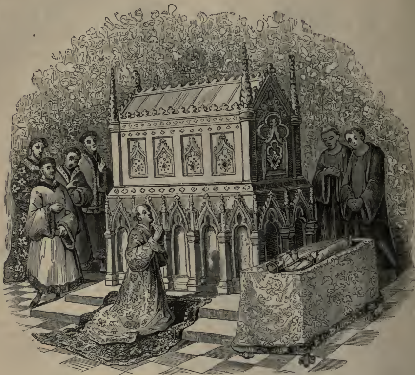
SHRINE OF ST. AQUAIRE. Presentation of the Waxed Figure of the King.— Designed from Contemporary MSS.

tion of the king. A similar offering was made to Saint Hermier in Rouais, who has the reputation of curing madness, and wherever there were saints that were supposed to have efficacy, by their prayers to God, in such disorders, thither were sent offerings from the king, with much ceremony and devotion.